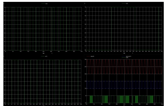
Figure 2. circuit waveform