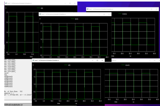
Figure 2: Implemented waveform.